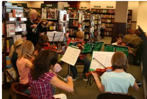
Members of the Crestview Orchestra perform at the Crestview/B&N Book Fair.