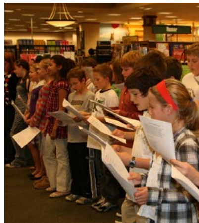
Crestview's Tiger Choir entertained the audience at the Crestview/Barnes & Noble Book Fair!