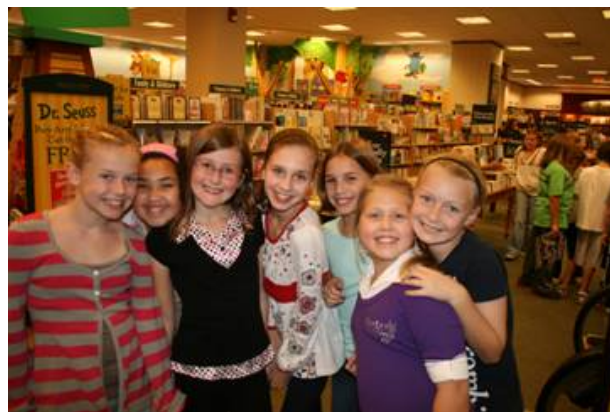
Friends sharing a good time at the Book Fair.